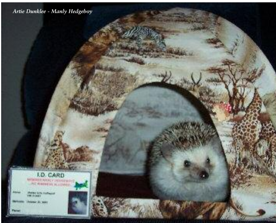
Artie Dunklee - Manly Hedgeboy